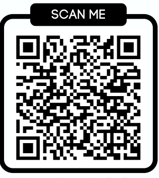
Keeping Adults Safe Policy