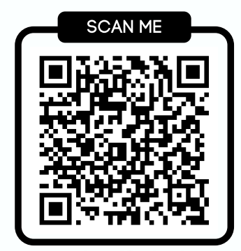
YMCA Christian Emphasis