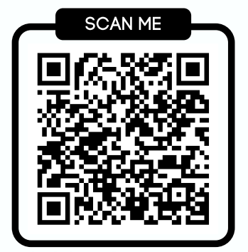
<u>Child Safeguarding</u> <u>Statement</u>